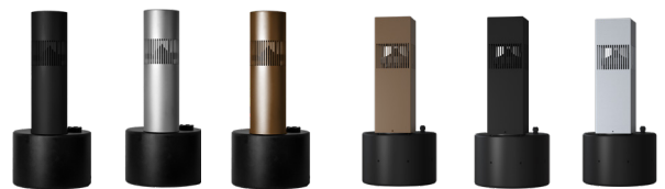
Available In Round or Square Shell, Silver, Bronze or Black Colors.